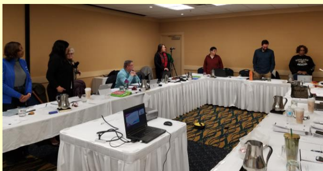
Above & Below: MI-CAPP Committee Chairs Take Oaths

On December 8, 2017, the outgoing and incoming MI-CAPP Boards of Directors came together to facilitate a smooth transfer of documents and knowledge between the two groups. Chapter history, Board hierarchy and etiquette, service, and teamwork were all central themes.