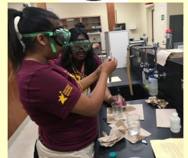
Students engage in hands on Chemistry Lab learning experiences